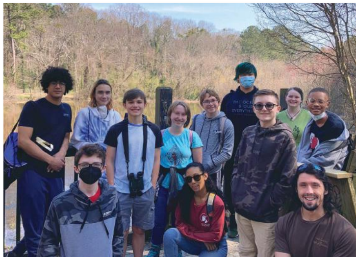
Georgia Urban Ecologists at Clyde Shepherd Nature Preserve.

The Master Birder program, with two divisions routinely offered in Atlanta, has now successfully partnered with other Audubon chapters in the Savannah area, co-hosted