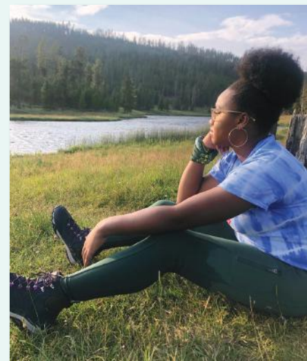
Spending time in nature is good for your mental health.

endeavor. If more in-depth time is needed outdoors to battle more significant mental issues, it may be better to remove the competitive aspect (whether with yourself or friends) every once in a while. Go out by yourself or with your dog or a close friend and watch the birds with all of your senses ready to receive. Use this time to think clearly through your dilemmas, or take the time to escape and let the sounds of nature fill the space.