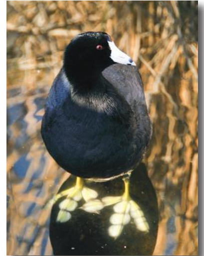
American Coot