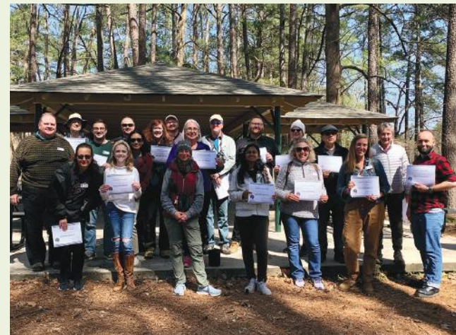
Spring 2022 Master Birder Graduates.

The course will fill quickly, so please register soon. To learn more or register, visit www.georgiaaudubon.org/master-birder-program .