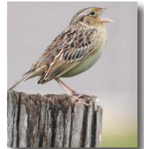
Grasshopper sparrow