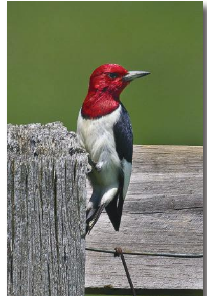
Red-headed Woodpecker, by David Boltz.

To learn more or sign up, visit www.georgiaaudubon.org/field-trips .