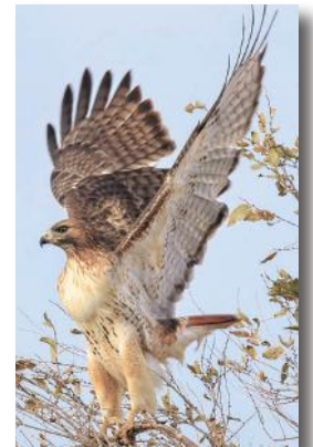
Red-tailed Hawk.