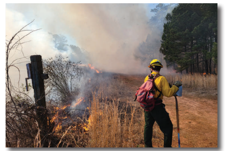
Gabe Andrle monitoring a recent burn in the restoration meadow at Panola Mountain State Park.

Prescribed fires have been proven to be instrumental in fostering early successional songbird habitat. Strategic burns create open spaces and clearings that are conducive to the growth of native vegetation, providing crucial nesting sites and foraging opportunities for early successional songbirds. These intentional fires mimic natural ignition processes, promoting biodiversity and maintaining the balance of ecosystems. Furthermore, prescribed fires help reduce the accumulation of dense vegetation, which can otherwise