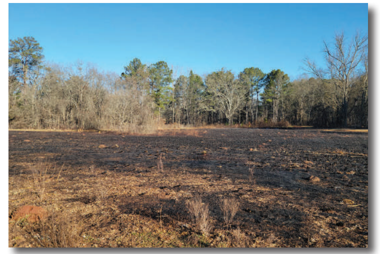
The restoration meadow at Panola Mountain State Park post burn.

Stay tuned for updates as Birds Georgia continues to work with partners to foster and improve healthy ecosystems through informed and strategic fire management practices. Together, Birds Georgia aims to kindle positive change and preserve the ecological balance of our landscapes for birds and future generations.