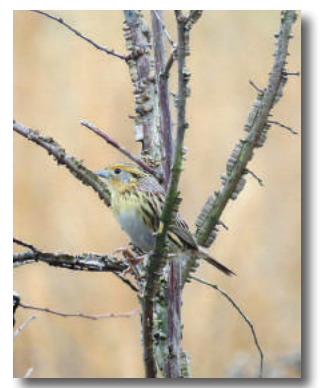
Lincoln's Sparrow.

In collaboration with the National Parks Service at CRNRA and the Chattahoochee National Park Conservancy, Birds Georgia will improve and restore a minimum of 16.5 acres of birdfriendly habitat at the Cochran Shoals Unit of CRNRA, including the "sparrow field." The remaining acreage will be treated for invasive plant species and opened up