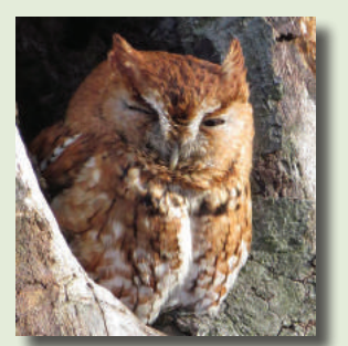
Eastern Screech Owl.

Georgia's birds face unprecedented challenges. Habitat loss, pollution, and other human-caused threats are putting birds' survival at risk. That's where you come in. By supporting Birds Georgia's Annual Fund, you help fund essential education, conservation, and community engagement programs that are working tirelessly to protect Georgia's bird populations. Whether it's providing educational resources to schools, restoring crucial habitats, or advocating for protection policies, every gift you give helps ensure a brighter future for Georgia's birds. Make a gift today at www.birdsgeorgia.org/donate.