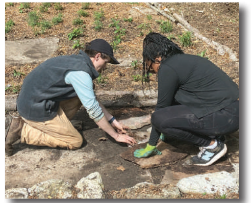
Working with volunteers to install a pollinator garden at the Heather Ivy Society.

A t Birds Georgia, you'll often hear us say, "Everyone is a birder, they just may not know it yet." Using that frame of reference, our community engagement team is committed to introducing birds and bird watching to people across Georgia. Birds are a catalyst for conservation, and learning more about birds can lead people to a deeper understanding of the natural world and healthy ecosystems. Birding and spending time in nature has also been linked to enhanced mental health, and who among us does not need the sense of peace and tranquility that birding and spending time in nature brings?