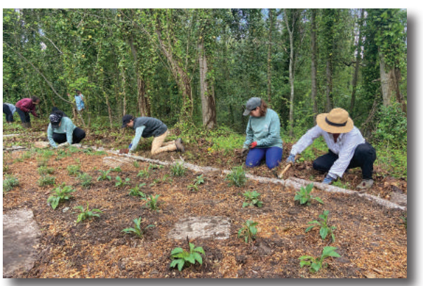
Volunteers assist with planting a pollinator garden at Heather's House in southwest Atlanta.

To learn more or sign up, visit www.birdsgeorgia.org/field-trips.