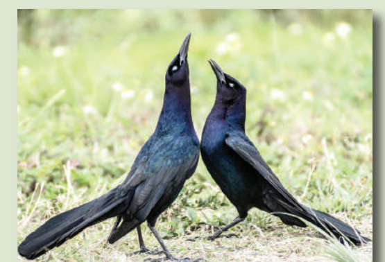
Boat-tailed Grackles.

There she usually lays two to four pale greenish blue eggs and incubates them for 13 to 15 days. Feeding the young is entirely her