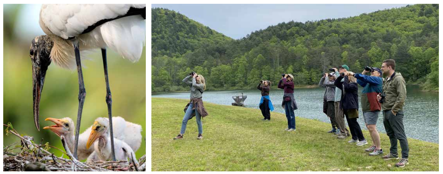
Wood Stork

In 2024, Teen Trip Leaders will take charge of conducting Bird Fest field trips, offering a safe and comfortable environment for teenagers to explore the wonders of birds. Additionally, we proactively engaged with student groups from various colleges to understand how Birds Georgia can support their efforts in promoting birding on campus. Through these meetings, we discovered that several campus groups are already striving to introduce birding to their fellow students. Looking ahead, Birds Georgia is committed to encouraging and providing safe spaces for their curiosity to flourish, thereby nurturing the next generation of conservation leaders.